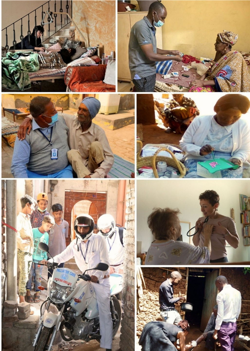
Photo credits and descriptions at the end of the document. Photos used with permission.

This Manual is intended to support health professionals providing generalist or primary palliative care. These photos, submitted by IAHPC members for the 2021 and 2023 photo contest, depict different moments of palliative care provision in primary care around the globe.